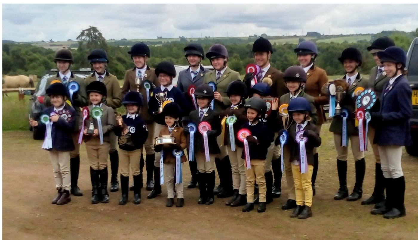
IPC Summer Camp 2019