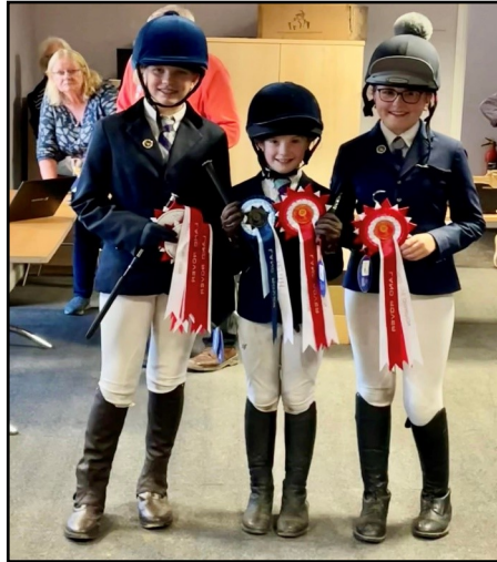
Top Left : SJ at Gatcombe, Area 7 Show Jumping at Solihull