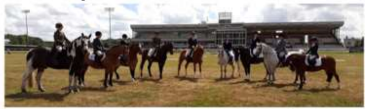
Area 7 Dressage