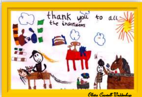
Olivia Caswell Wedderkop