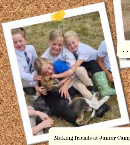
Making friends at Junior Camp.