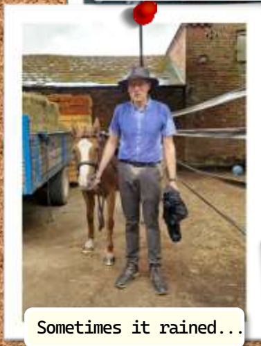
Sometimes it rained...