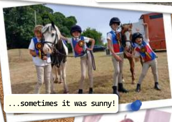
...sometimes it was sunny!