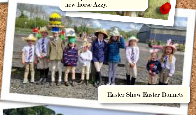
Easter Show Easter Bonnets