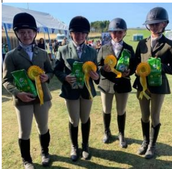
Our 4th placed PC80 dressage team