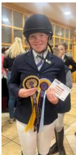
Rowan finished in 5th place individually in the PC70+ and qualified for regional championships!