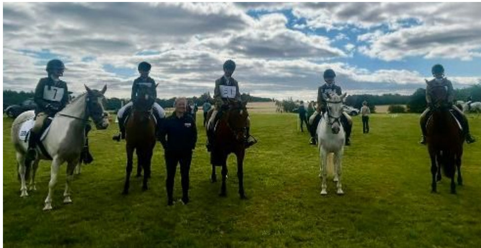
Our PC70 dressage team which came 5th