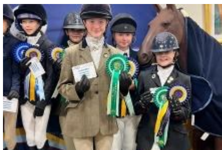
The PC70 dressage team were third and qualified for Regional champs