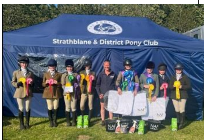
All the dressage winners. Not one person came away without a rosette!